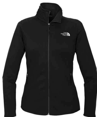
Black 7C & Cool Grey 10C